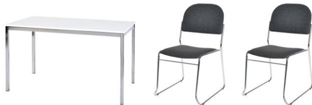
Option 1: regular