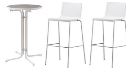
Option 2: standing